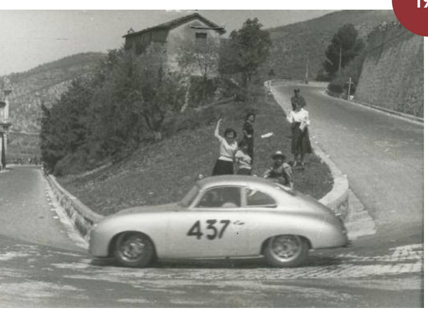
Below: The Mille Miglia lives on to this day and the author was able to fullfil a dream in 2015 when he entered his 356 in the Italian classic event.